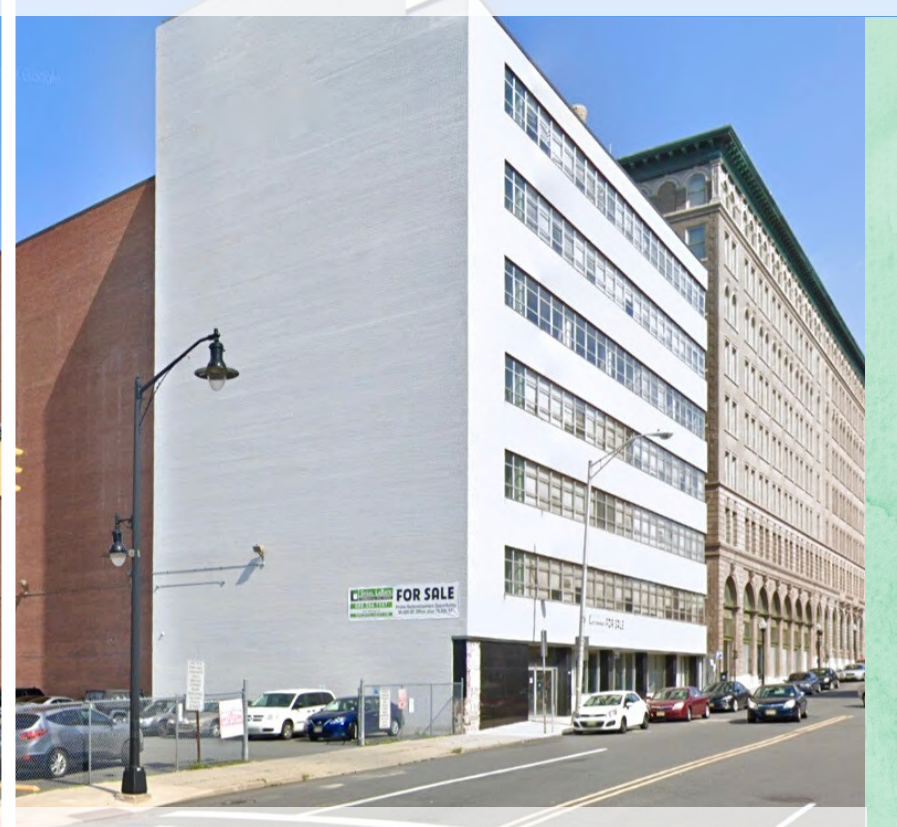
25 South Montgomery Street Trenton, NJ